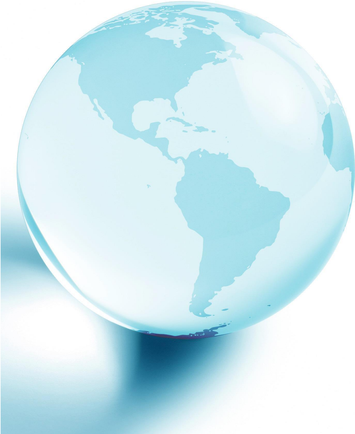
Adapted from materials from Girl Scouts of N. Cal.